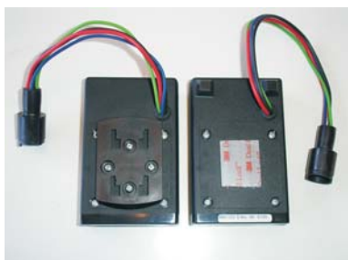
New and old DBS mounting